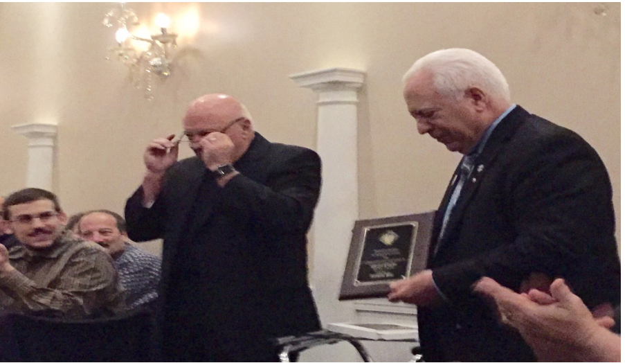
ored for the trehas done as the the past two